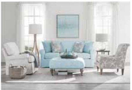
Call for your complimentary in-home consultation today!